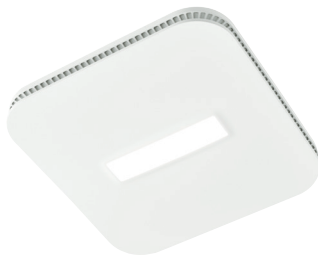
AE80LK | AE110LK