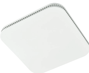
AE80K | AE110K