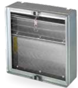
Radiation Damper Model RD1