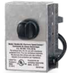
Variable Speed Control Model 80L