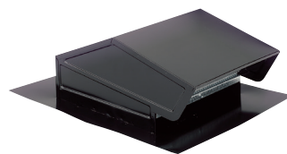
Roof & Wall Caps